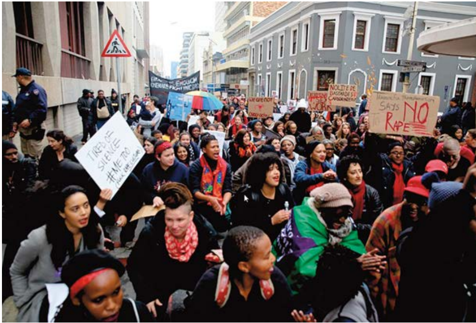
Intergenerational anti-GBV protest in South Africa.

ent forms of feminist organising spaces for support and solidarity than how we view other relationships that we need to interrogate more.