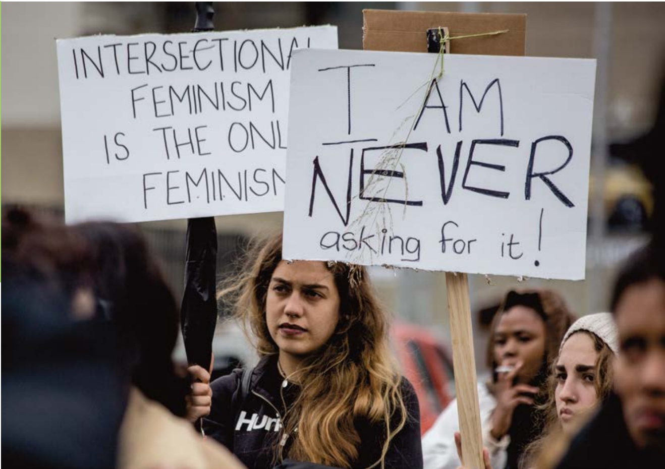
A woman advocates intersectional feminism at a protest in South Africa.